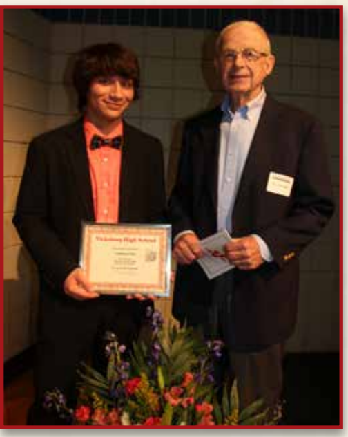
2016 Appell Family Scholarship