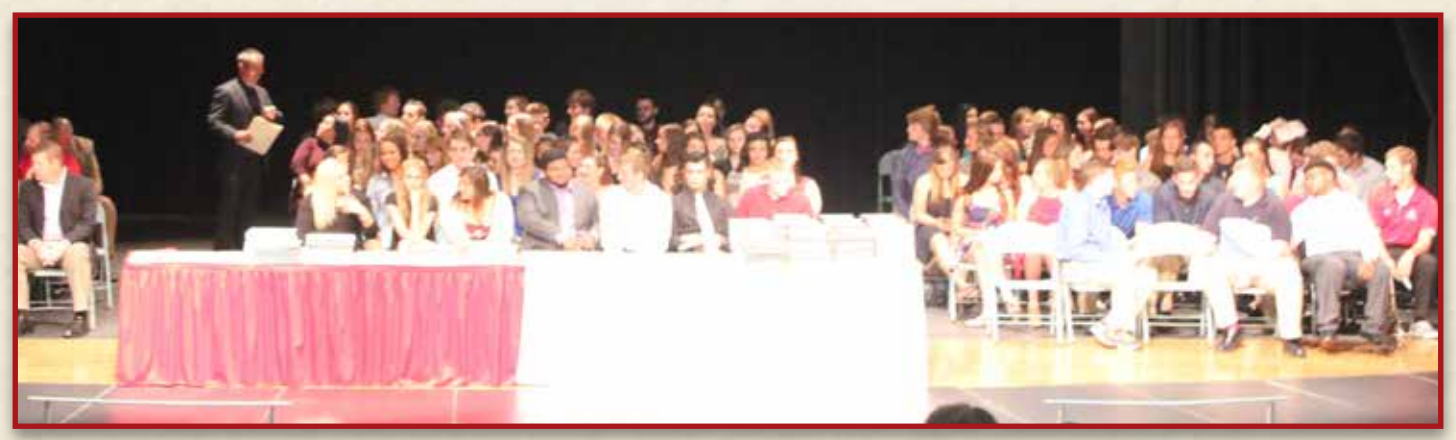
2016 VHS Honor Students