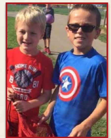
Students excited about new equipment from the Beautification Team's "Playground Shower"

The focus on a positive culture, led staff, parents, and students to plan two special "beautification" days at Sunset to improve the physical environment through positive pictures, color, and words. Through the theme: Together, We are Building Leaders , teachers and staff help all students see themselves as leaders. Each month, the building focuses on a specific habit, as students learn about, practice, and live it.