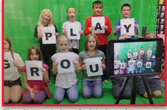
Tobey students supporting the new all-inclusive playground

Veterinary Science students will provide routine veterinary services for animals housed at Tillers International, Aacorn Farm, and Gull Meadow Farms. Students will perform routine health assessments and keep appropriate medical records. Funding for transportation to the community sites and additional equipment and supplies were provided by this grant.